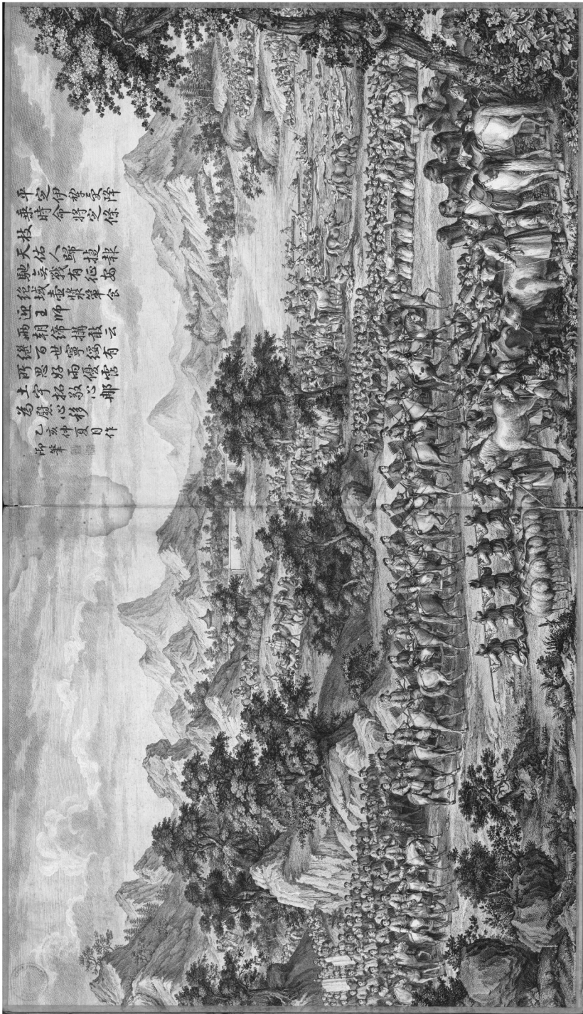
Fig. 1 Receiving the Surrender of the Ili (1)